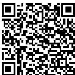
Public Health Wales